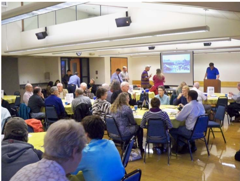
Even More Banquet Attendance