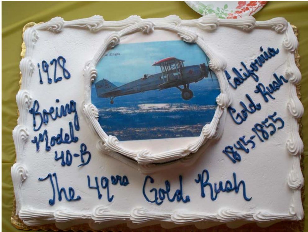
BECC Banquet 49 th Anniversary Cake