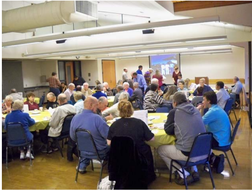
More Banquet Attendance